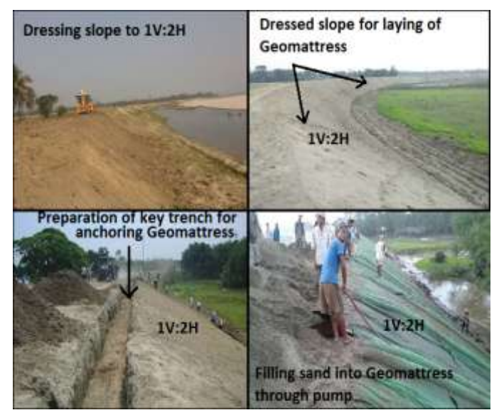
Fig. 5. Installation of Geotextile mattress at various stages

Bank revetment and launching of apron is being carried out for left and right bank embankment of Ranganadi River at various vulnerable reaches for a total length of 7200 m where the river bank is dressed to the inclination of 1V: 2H and over this a layer of geotextile tubular mattress of 0.3 m fill height is laid and anchored at the top and toe of bank slope by bending the mat into key trench of size 1.0 m x 0.75 m. Geotextile mattress is a double layered composite geotextile fabricated to form a three dimensional mattress after filling sand through pump at design slope of affected reach, the upper layer of the mattress is made from polypropylene woven geotextile needlepunched with a mixture of Ultraviolet (UV) stabilized green fibers and cut tape yarns and the lower layer of the mattress is also a UV stabilized polypropylene woven fabric. Total quantity of geo-mattresses under use is 1061939 m<sup>2</sup>. Figure 5 shows installation of geotextile mattress at various stages.