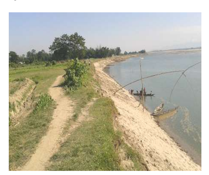
Fig. 3. Erosion of cultivable land