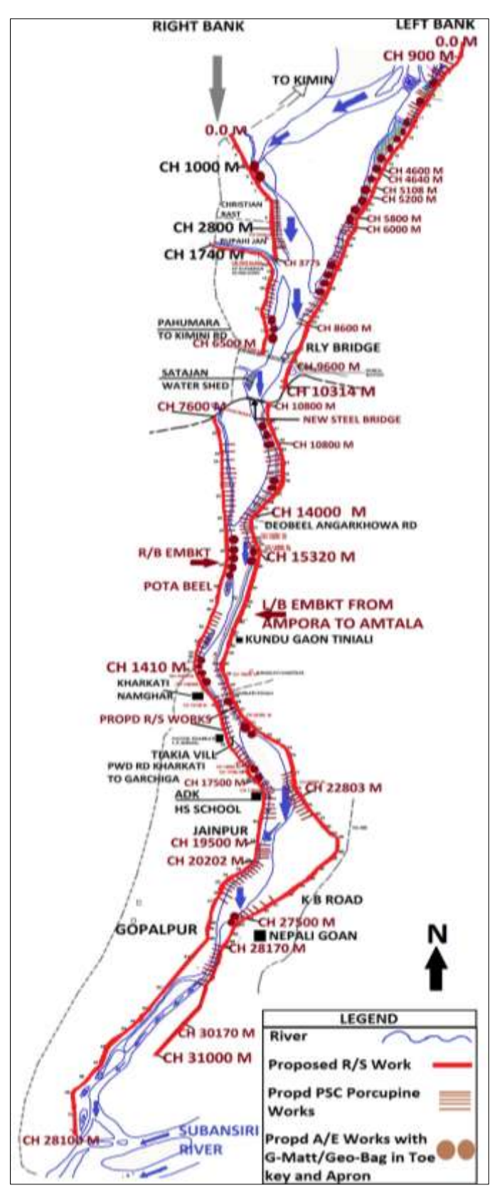
Fig. 4. Location of anti-erosion and river training work