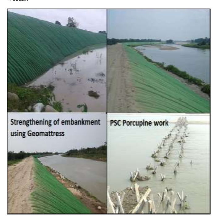
Fig. 7. Implementation of geotextile mattress and porcupine works

The paper presents the problems and the remedial works along the vulnerable reaches of River Ranganadi. The problem of flood and erosion in Assam is of high magnitude and to effectively deal with these issues, permanent solution will be essential in the near future. Such application replaces all other conventional methods (e.g. boulders, RCC etc.) for immediate protection where flood is a regular phenomenon and construction is to be completed in a limited time period. The use of geotextiles materials permits to carry out the protection works at a faster rate. The use of the mechanically twisted zinc coated wire mesh gabion box ensured the stability of the geotextile bags and provide confinement in toe-key. Figure 7 shows implementation of geotextile mattress and porcupine works.