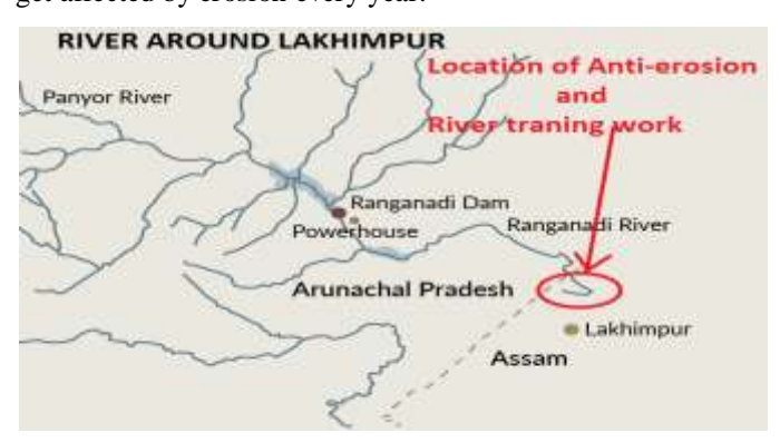
Fig. 1. Location of Ranganadi River and Dam

phenomenon all along the course of the river and new areas get affected by erosion every year.